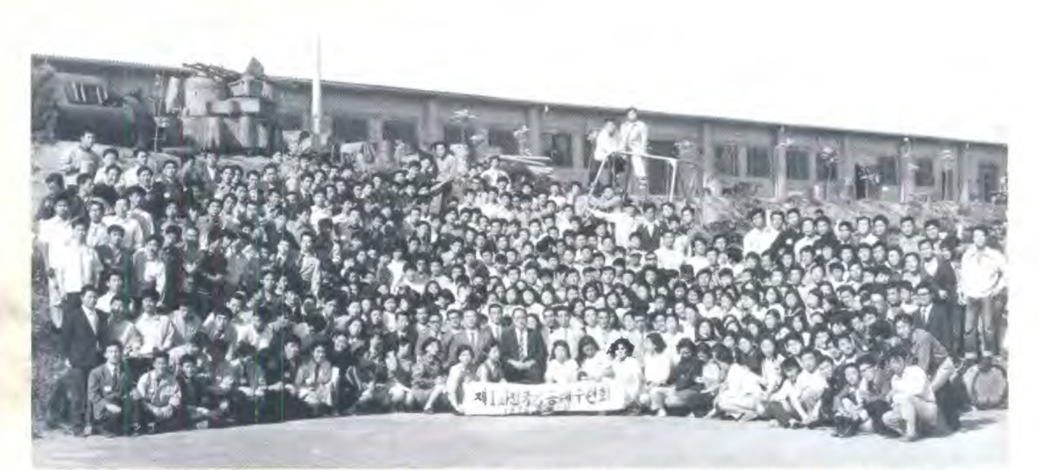
Father joins participants in marking the completion of the first national workshop for the Korean mobile team, May 31, 1972.

They said, "Pay ₩150 million." In about six months, they said, "Then, take it at just ₩120 million."