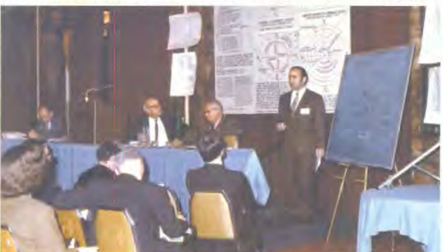
The first ICUS was held in November 1972 at the Waldorf-Astoria Hotel in New York City.

2 The autarkic ideology Father refuted on his 1991 visit to North Korea.