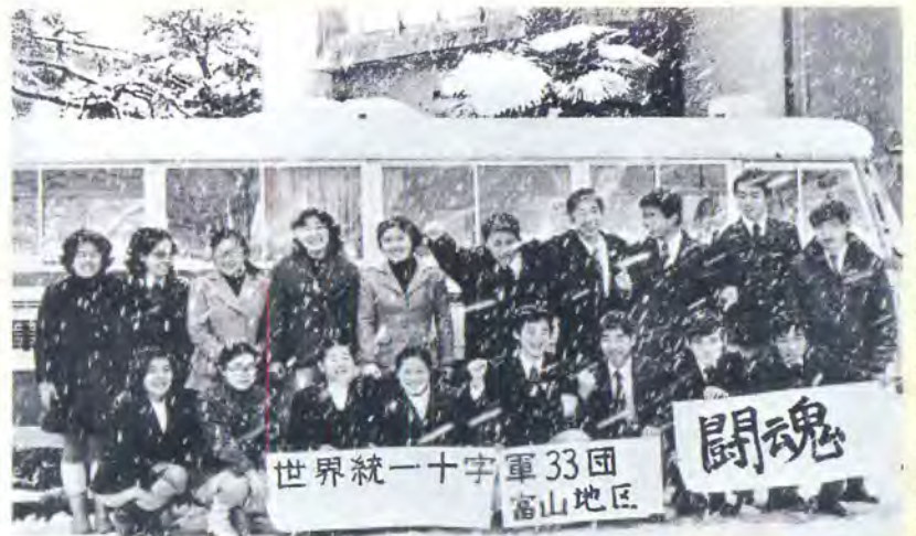
A mobile IOWC team of Japanese members braving the winter elements in their native land in December 1972