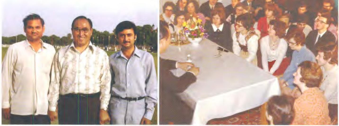
Left: Father in New Delhi in mid-April. Father spent just a day or two in most of the countries he visited; Right : Father speaking with Austrian members during True Parents' stop in Vienna.